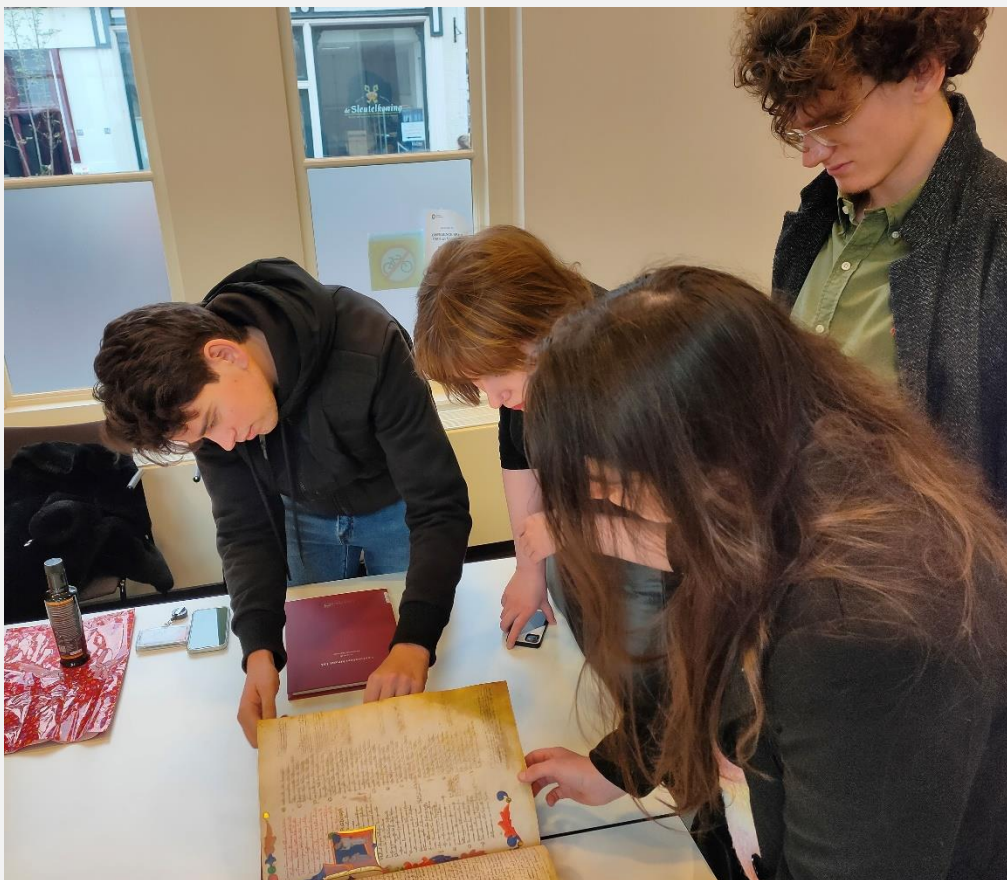
Viewing of the volumes