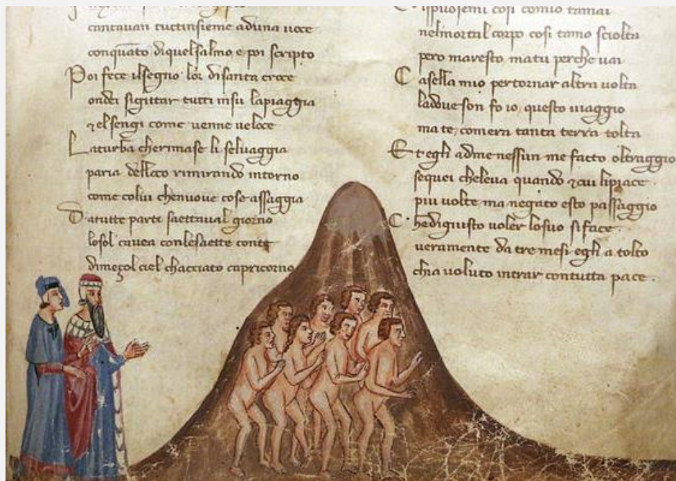
Divine Comedy · Purgatory II, codex Strozzi 152