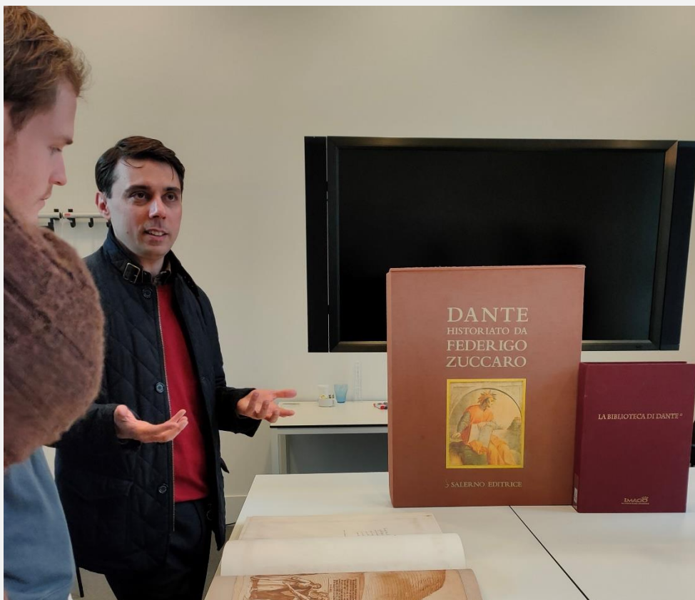
Debate on Strozzì's and Zuccaro's codices