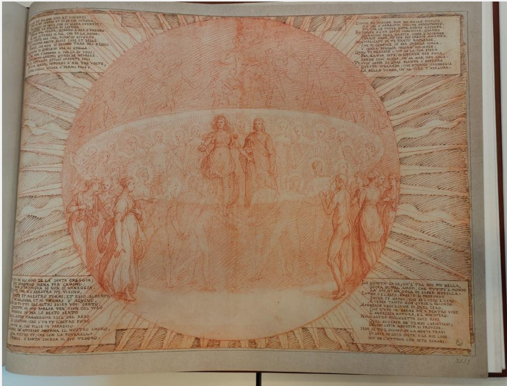
Dante Historiato da Federigo Zuccaro, facsimile at Utrecht University Library