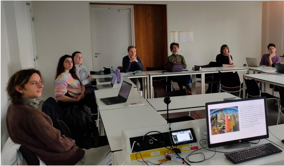
Students and auditors of the course Dante's Afterlives: Texts and Reception